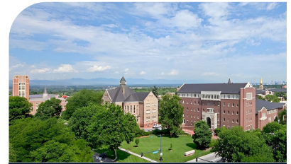
Daniels College of Business

The college is changing the world by immersing students in its experiential learning curricula.